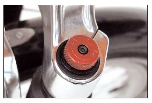
Turning knob for the pre-load of the suspension fork BALLISTIC XL-600All

It is sufficient to set the pre-load in the two fork legs to approximately the same level. It is not necessary to match them exactly.